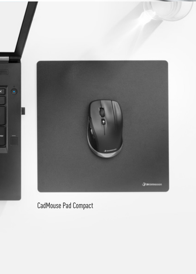
CadMouse Pad Compact

Dedicated Middle Mouse Button – the days of clicking the mouse wheel are over thanks to the CadMouse's intelligent ergonomic design.